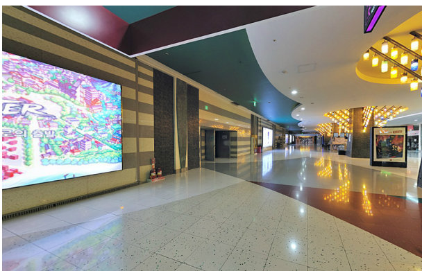
Figure 2. The exit door of COEX Megabox Movie Theater Complex toward a main corridor

Lastly, a specific recommendation is made for the Megabox Movie Theater Complex, which is the largest anchor tenant in the COEX Mall. As seen in the Figure 2, audiences are forced to exit toward one of the main pathways at the opposite area of its main entrance. Nevertheless, it is just an empty pathway with advertising billboards on the wall despite its high potential as an arcade with individual general tenants. Therefore, facilities that are practically impossible to re-position, due to complicated spatial conditions and special equipment, such as the Megabox Movie Theater Complex and the Aquarium, should not neglect their adjacent pathways as seen in Figure 2, but should consider installing individual general tenants to revitalize active commercial operations.