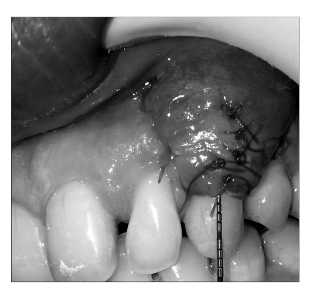
Fig. 6. Suturing of double gingival flap over the connective tissue graft. Following suturing of two flaps together, the entire unit was advanced and sutured, in order to cover the connective tissue graft coronal to the cement enamel junction.