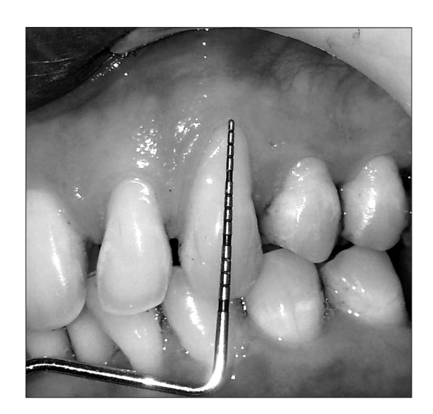
Fig. 1. Preoperative state of the maxillary left canine. Note the gingival recession as shown by graduated periodontal probe. About five mm of root exposure was assessed.

Microsurgical instrument set was arranged for periodontal microsurgery to be performed for maxillary left canine (23). All the measurements of gingival recession were made with University of North Carolina (NC, USA)-15 periodontal probe.