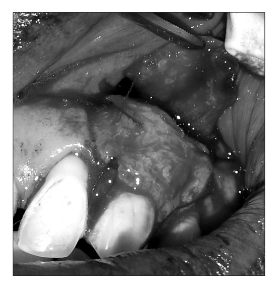
Fig. 5. Suturing of connective tissue graft on the denuded root surface. A connective tissue graft has been positioned and sutured with resorbable sutures over the denuded root, just apical to the cementoenamel junction.

Antibiotic therapy (Amoxicillin 500 mg, Novamox; Cipla, Mumbai, India; three times a day) and suitable analgesic was prescribed for five days. Tooth-brushing was discontinued for the first two weeks at the surgical site. Chemical plaque