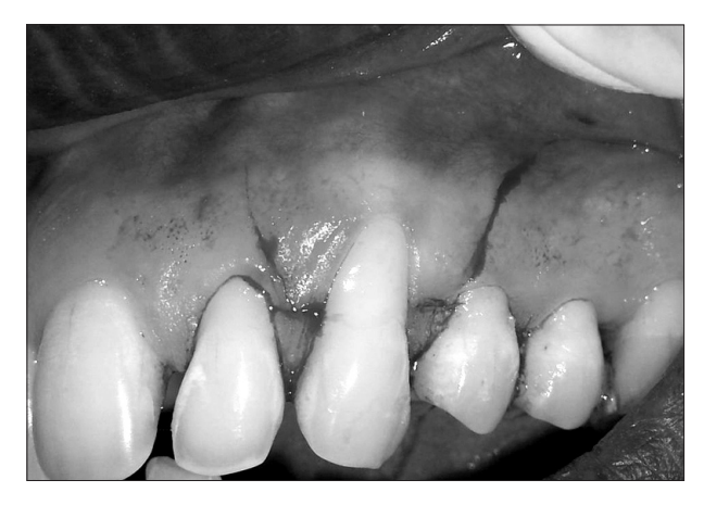
Fig. 2. Preparation of recipient site. Full thickness flap is dissected using mesial and distal vertical incisions extending beyond mucogingival junction.

Harvested connective tissue graft (Fig. 4) was sutured on the recession area of recipient site with 6-0 resorbable suturing