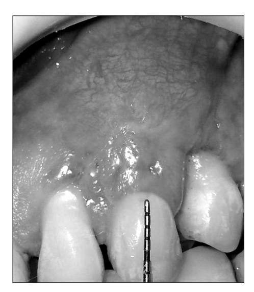
Fig. 7. Clinical postoperative view at three months. Complete root coverage on maxillary left canine; with an increased thickness of gingival tissue have been achieved. A good esthetic outcome with proper color match has been obtained.