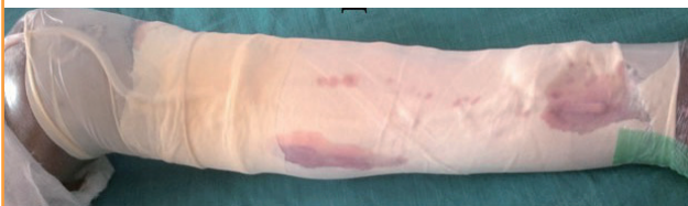
Fig. 3. Leg wound healing 12 days after dressing

For lengthy wounds, multiple gynaecological gloves can be cut and applied in a sequential overlapping manner.