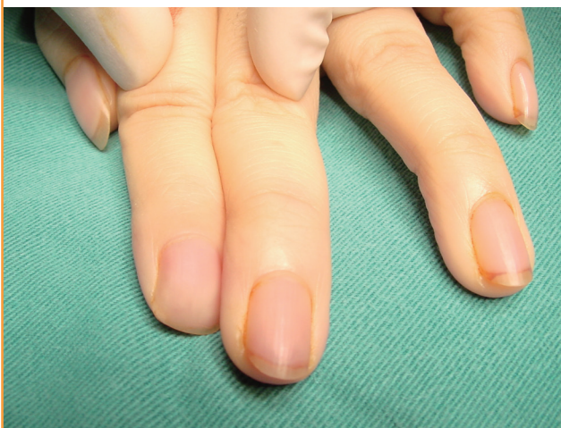
Fig. 2. Glomus tumour obvious intraoperatively

Left middle finger glomus tumour that is not obvious to the naked eye.