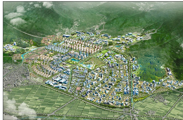
Fig. 1. A blueprint for Daegu Technopolis within Daegu Gyeongbuk FEZ

A notable goal that the City of Daegu in partnership with the neighboring Gyeongbuk Province is to create a successful Free Economic Zone (FEZ) within the region. The establishment of an FEZ had been encouraged since 2007, mostly by local leadership, so as to offer “optimal business environment by providing financial incentives, relaxed regulations, and customized facilities to global companies” (DGFEZ 2012). DGFEZ covers a total area of 40km 2 in 10 separate industrial districts in Daegu and four cities (Gumi, Gyeongsan, Yeongcheon and Pohang) of Gyeongbuk. This is one of the latest FEZs in Korea approved in 2008.