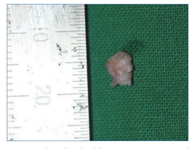
Fig. 2. Excised mass from the philtrum contains 4 \times 5 \times 7 mm sized mass, which contains a fistulous tract. The fistulous tract was observed in the center of this excised sample.