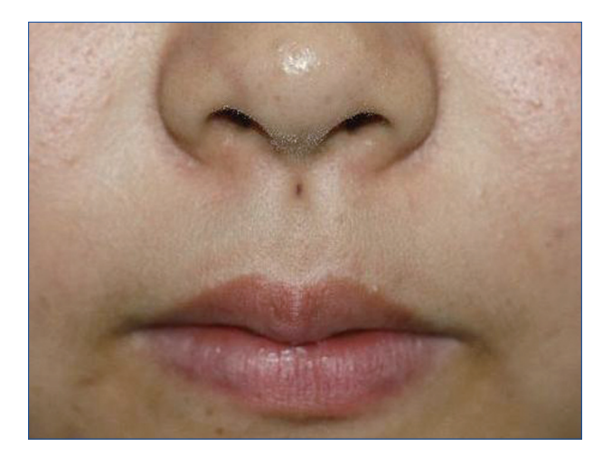
Fig. 1. Preoperative view: 0.5 \times 1 mm sized small pit is visible in midline of the philtrum.