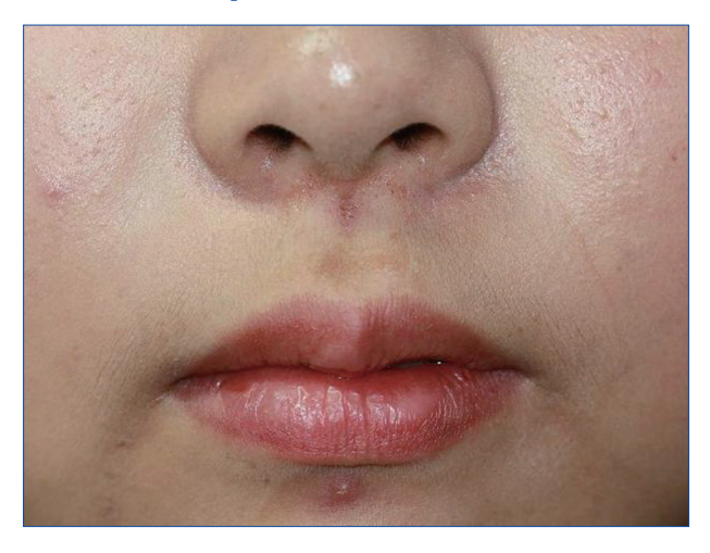
Fig. 4. Postoperative view 1 year after the complete excision was performed.

The fistulous tract was removed under local anesthesia. The lesion ended just beneath the mucosal surface of the upper lip and did not communicate with the oral or nasal cavities. The size of the specimen was 4 \times 7 \text{ mm}^2 (Fig. 2). Microscopic examination revealed that it was lined by cornified squamous epithelium with sebaceous glands and hair follicles surrounding the end of the tract (Fig. 3). Ectopic tissue was not found. No postoperative recurrence was noted on one-year follow-up (Fig. 4).