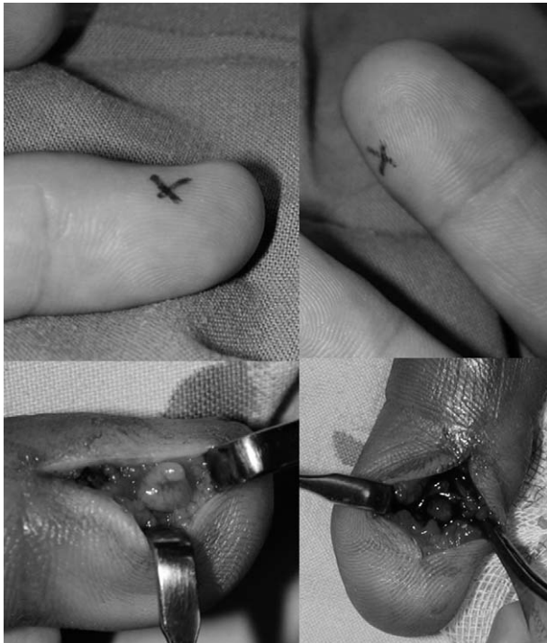
Fig 3: Double Pulp tumors on both hands in one patient. Both the tumors were excised at the same time.

The mean follow-up period was 2.4 years and none of the patients complained the same characteristic pain at the last visit. All cases were confirmed as glomus tumors by pathologic examination.