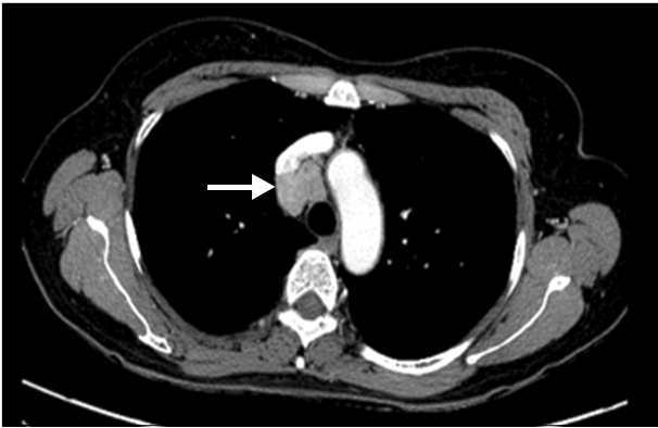
Fig. 1. Preoperative heart contrast computed tomography scan shows round shaped mass in the right paratracheal area (arrow).

18 F-fluorodeoxyglucose positron emission tomography (PET) scan and 11 C-acetate PET are useful for diagnosing a thymoma from the middle mediastinum as ectopic thymic tissue.