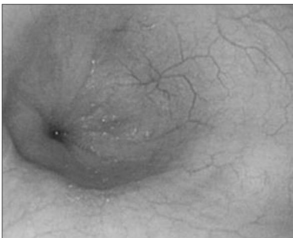
Fig. 1. Esophageal endoscopy shows a stenotic central lumen at 30 cm distal esophagus from the incisor.

A 12-year-old boy presented with increasing difficulty swallowing solid foods and vomiting. He had vomited frequent since 5 months of age. The cause of the vomiting had not been evaluated. At 5 years