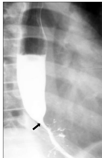
Fig. 2. Esophagography shows a luminal narrowing (arrow) of the distal esophagus with multiple extraluminal filling of barium and dilatation of the proximal esophagus.

of age, he had a history of a foreign body (a bolt) ingestion in the esophagus. The bolt was not spontaneously passed into the stomach, and so it was removed by endoscopy. On admission, he had a body weight of 32 kg (10-25th percentile) and a height of 143 cm (10-25th percentile). On hospital day 2, we performed an upper endoscopy and esophagography. The endoscopy showed a stenotic central lumen at distal 30 cm from the incisor with proximal widening of the lumen (Fig. 1). There was no evidence of mucosal breaks or erosions. The endoscopic probe (Olympus GIF-XQ260, 9 mm diameter) could not be advanced into the stomach. The esophagography showed that there was a circumferential luminal narrowing of the distal esophagus with multiple extraluminal filling of barium and dilatation of the proximal esophagus (Fig. 2). Peristalsis of the esophagus was normal. We suspected that the esophageal lesion was a CES. On hospital day 3, we performed EUS to make a differential diagnosis of TBRs and FMH. EUS was conducted using a high-frequency miniprobe catheter (UM-DP20-25R, 20MHz; Olympus Optical, Tokyo, Japan). EUS showed that multiple hyperechogenic spots had spread into the muscle layer of the stenotic le-