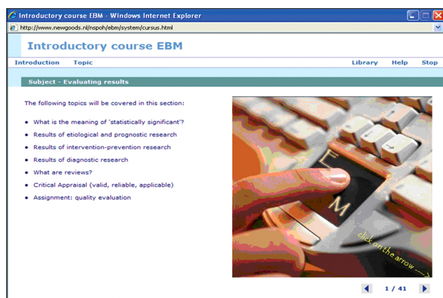
Fig. 1. 'Start' screen on the topic "Evaluating results" presents the issues covered.

In order to describe the study population, demographics of participants (country of residence, age, gender), experience as an OP, work setting, and previous training in research methods, epidemiology, statistics, or EBM were assessed at T0. The utility and feasibility of the electronic EBM course were assessed at T1, directly after completing the course. Knowledge, skills, attitude, behaviour, and determinants of behaviour related to EBM were assessed at all moments T0, T1, and T2. Evidence use was only assessed at T0 and T2, since T1 was too soon af-