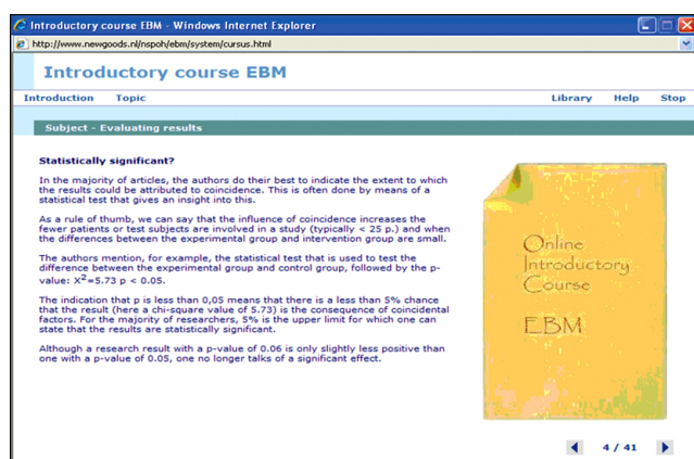
Fig. 2. Information screen on 'statistical significance' in the section "Evaluating results."