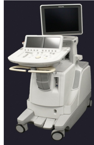
Fig. 1. IE33 echocardiography system (Philips Healthcare, Netherlands).

The difference between gated ^{201}\text{Tl} SPECT and echocardiographic results was examined by repeated-measures ANOVA.