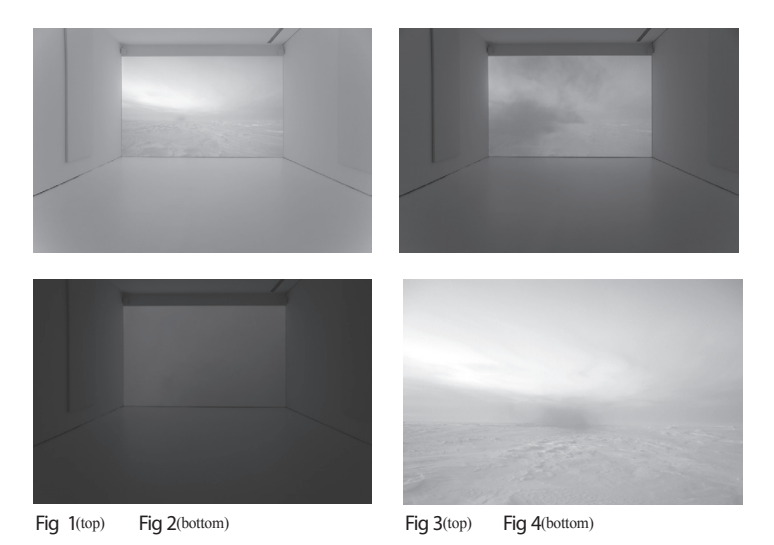
Fig. 1, 2, 3 Charles Stankievech, LOVELAND , video installation view, 2011, Musée d'art contemporain de Montréal, photograph courtesy of artist