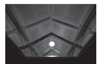
Fig 6 Charles Stankievech, LOVELAND , interior view of mirror vitrine with special LOVELAND edition of The Purple Cloud by M.P. Shiel behind diachronic glass, 2011, Musée d'art contemporain de Montréal

environmental politics, I suggest that Stankievech employs an apocalyptic trope in reference to the precarious and problematic position of the North in the current political and ecological climate. Revisiting critiques of modernist exhibition practices and considering phenomenological approaches to perception, my analysis focuses primarily on the experience of the installation's spectator. Attending to the inclusion of Shiel's novel and acknowledging that apocalyptic fiction typically spares at least a single survivor to witness, lament and provide hope for the continuation of the species, I examine the role played by LOVELAND's spectators as the only human actors present in the installation. Visually, aurally and phenomenologically immersed, the viewer is subjected to, and implicated in, the events unfolding on the screen and within the space. Due to the looping of the video footage, I argue that the imaged event is presented as endless - incessantly enacted, yet infinitely deferred - and that this temporality of interminable duration and delay is fundamental to the spectator's sublime apocalyptic experience. Indeed, LOVELAND's spectator is enveloped in an unceasingly extended present moment: both rescued from the Rapture and denied access to the end.