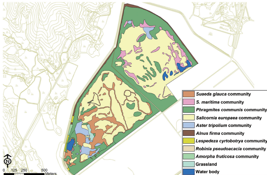
Fig. 2. A physiognomic vegetation map showing the projected area for the Gwangyang Container Port.

ment 2006). Mean annual precipitation and temperature at Suncheon weather station, which is the closest weather station to the study area, were 1,487 mm and 12.5°C, respectively.