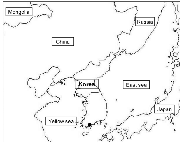
Fig. 1. A map showing the study area.

To date in Korea, most studies on salt marshes have focused on the environmental factors affecting vegetation (Lee and Kim 1988, Lee et al. 2009) such as characteristics and distribution of halophyte (Ihm 1989, Lee 1989, Ihm et al. 1995a, 1995b, 1998a, 1998b, Kim et al. 2005, Han 2008). Therefore, many studies haven't been done regarding salt marsh restoration, particularly through the use of seed