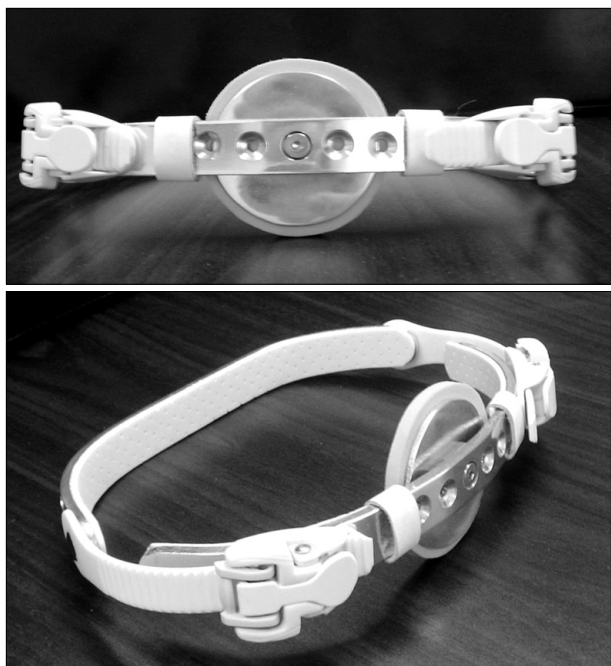
Fig. 1. This photograph shows a compression treatment brace designed by our medical team. It is light and self-adjustable.

ly concealed with clothes. This issue tends to worsen as the deformity develops during puberty when growth accelerates [1-4].