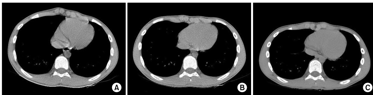
Fig. 3. These computed tomography scan images show three consecutive images taken from the same patient before, during, and after the recommended cycle of bracing treatment. A dramatic improvement in protrusion of chest wall is noted. (A) Before brace. (B) 2 months after brace. (C) 6 months after brace.

and a decrease in lung compliance due to chest wall rigidity. However, in the majority of them, the problems are confined to psychological and cosmetic issues. This has caused a strong desire for developing a less invasive treatment. Correction by bracing was first reported by Haje [10] in the 1990s, and many clinical trials are actively being performed worldwide. The majority of the trials have reported good responses.