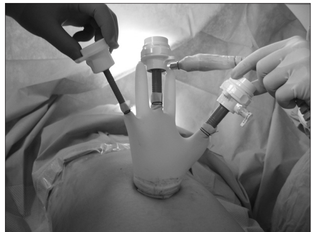
Fig. 1. Home-made single-port device was made from small wound protractor and a surgical glove with conventional laparoscopic trocars.

The diagnostic tools used most often to characterize the tumor before surgery were esophagogastroduodenoscopy (EGD) and computed tomography. All 10 patients underwent both, and 9 out of 10 also underwent additional endoscopic ultrasonography to delineate the anatomic layer of the tumor origin. All tumors were detected by EGD, and the mean tumor size measured by EGD was 2.5 cm (range, 1.2~5.0 cm). According to the EGD findings, all tumors