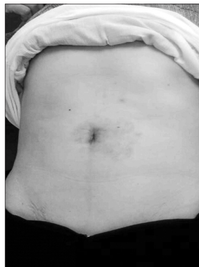
Fig. 3. Photograph of the abdomen taken 1 month after the operation shows excellent cosmesis with minimal scar.

In addition, SILS has some technical challenges. Insertion of several instruments, along with the laparoscope, into the abdominal cavity through a single incision markedly decreases the range of motion and results in conflict between instruments. This conflict makes surgical dissection much more difficult compared to conventional multiport laparoscopic surgery. It is also difficult to keep an ideal view due to consistent clash of camera with operating instruments, so that expert camera operator experienced in handling flexible or 30 degree laparoscope is essential. The use of articulating instruments (laparoscopic graspers, shears, and staplers) could improve the performance with less interference, and the recently introduced pre-bent instruments further facilitate the