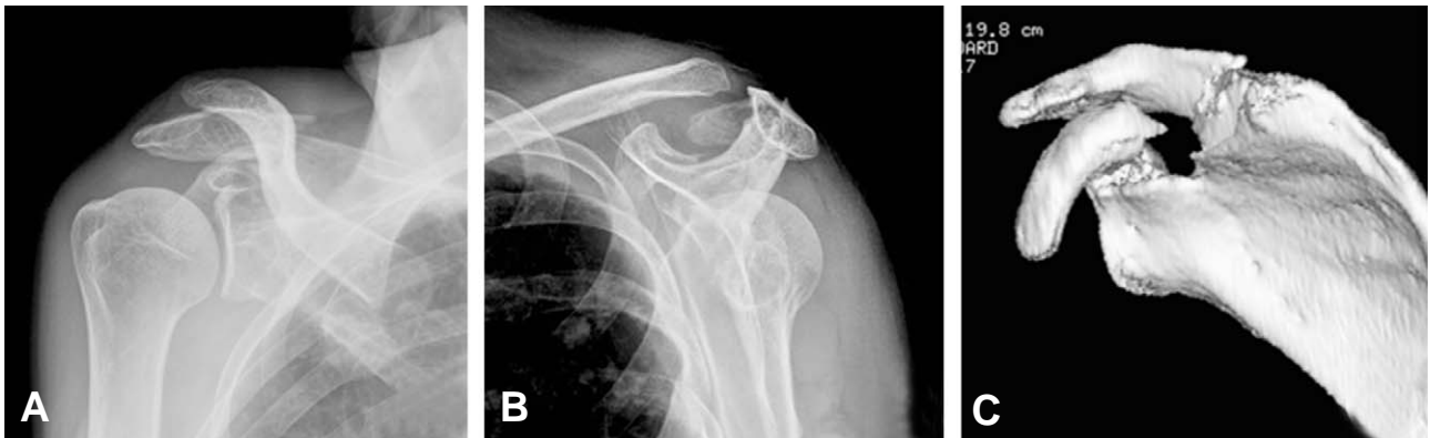
Fig. 1. Preoperative radiographs. (A) anteroposterior view, demonstrating the fractures of the scapular spine and of the base of the coracoid process, and the separation of the acromioclavicular joint. (B) Scapular Y view, demonstrating the fractures of the coracoid process and of the scapular spine, combined with the AC separation. (C) 3D CT images showing fractures of the scapular spine and of the coracoid process.

height during a mountain hike, landing on the posterolateral aspect of his right shoulder. The patient was referred to the authors' institution 10 days after the injury, and was treated by immobilization of his right arm in a sling for this period under the diagnosis of acromioclavicular joint separation. Physical examination showed tenderness at the coracoid process, at the base of the scapular spine, and at the acromioclavicular joint, which also had superior instability. The radiographs of the shoulder showed fractures of the scapular spine and of the base of the coracoid process, as well as the acromioclavicular joint separation. These injuries were confirmed by 3D computed tomography (Fig. 1). Additionally, we noted that the fractured scapular spine had rotated laterally, threatening to induce subacromial impingement