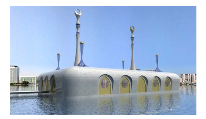
Fig. 9 Perspective of floating mosque

related energy brings the temperature down even further to 21°C. Electricity from solar energy is also required for the pumping equipment.