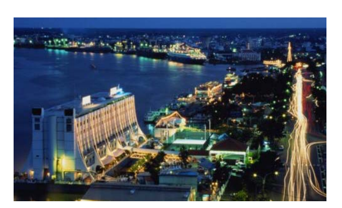
Fig. 2 Saigon floating hotel

The hotel, newly named as Saigon floating hotel(SFH)(see Fig. 2), was officially opened in December 1989. The hotel was the first obvious sign that "doi moi" had finally arrived in Vietnam, it was the only place in Ho Chi Minh City where foreigners could meet and socialize(Flicker, 2012).