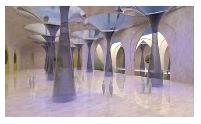
Fig. 10 Interior of floating mosque

The roof and walls absorb little heat because of porous external cladding, consisting of a sponge-like ceramic material with extremely low density. The thick external walls have a high accumulative capacity due to their high density and large size. Therefore, water cooling system can be more effective.