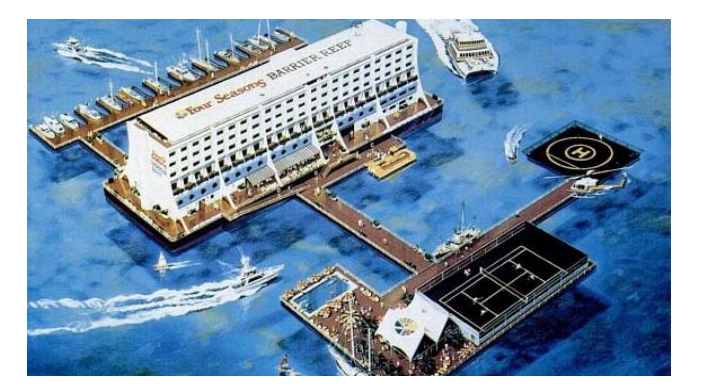
Fig. 1 Design of four seasons hotel complex

mainland port. Tour companies estimated that visitation could be significantly increased with shorter or faster trip, or through the provision of onsite fixed offshore accommodation.