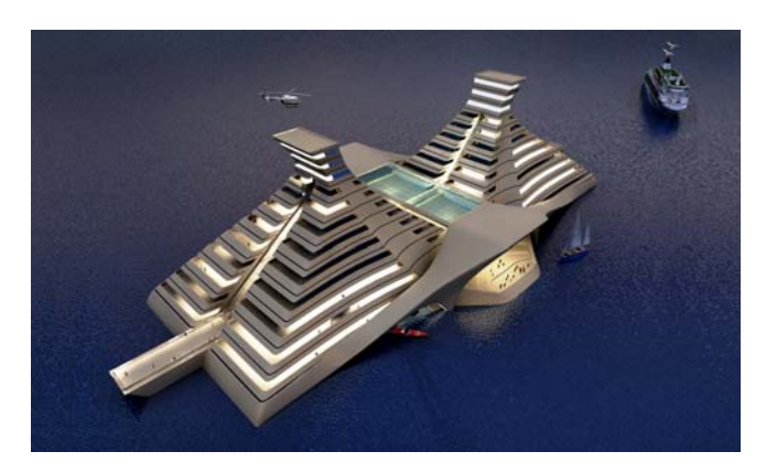
Fig. 13 Perspective of Maya hotel

Swedish Military but after the cold war it was allowed for this kind of private company to use.