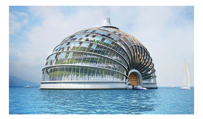
Fig. 11 Perspective of the Ark

The Ark concept, designed with the Union of International Architects' program "Architecture for Disaster Relief," could be realized in various climates and especially in seismically dangerous regions because its basement is a shell structure without any ledges or angles. A load-bearing system of arches and cables allows weight redistribution along the entire corpus in case of an earthquake. And also Its prefabricated frame can allow for fast construction.