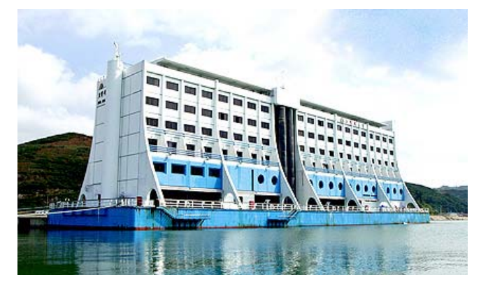
Fig. 3 Hotel Haekumgang

Its operation ended in August 1996 over 6 glorious years' business for unspecified reasons from the government. SFH was sold for decomposition in Singapore and left Bach Dang quay on April 1st 1997(Saigon Floating Hotel, 2012).