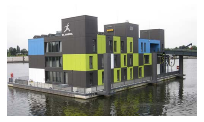
Fig. 7 IBA Dock