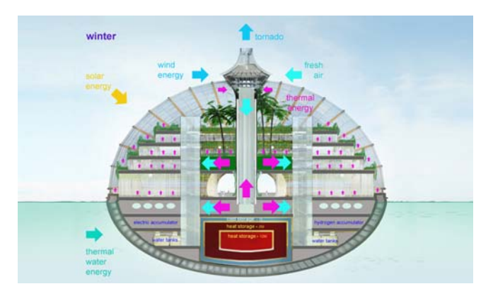
Fig. 12 Section diagram of the Ark

Sustainable features of the Ark can be summarized as a bioclimatic building with independent life-support system, use of solar photovoltaic cells/energy collector and wind turbine, enough daylight penetration through transparent roof, open layout to adapt different functions over time, new material "ETFE" for covering, and prefabricated frame for fast construction.