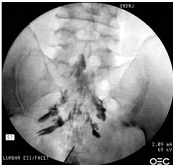
Fig. 1. The contrast agent flow to the left side. The number of cells to which the contrast agent flowed was eight (The result is judged as the flow to the left side because the quantity of the contrast agent that flowed to the left side was greater even though the number of cells to which the contrast agent flowed was the same as the two on the left and the right sides. A total of eight cells were contrasted: L5 middle, S1 middle, S2 left, right, and middle, S3 left, right, and middle.).

To analyze the contrast pattern, the L4, L5, S1, S2, and S3 levels were divided into 15 cells by sectioning each level into the left, right, and middle parts. For the L4 and L5 levels, the lateral contrast flow on the anteroposterior views of the epidurographic images with reference to the medial side of the left or right pedicle was judged as the