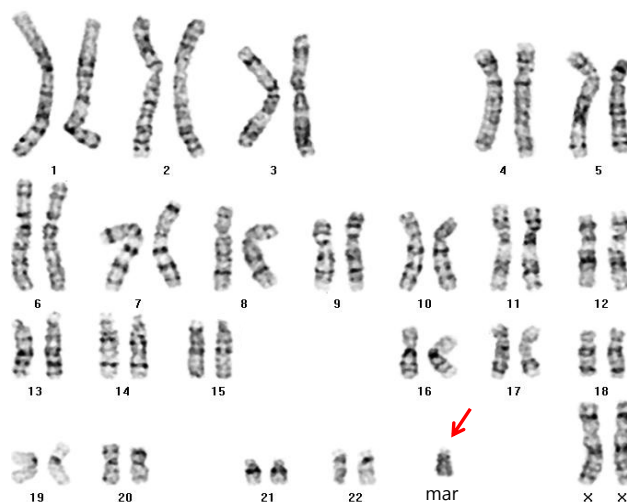
Fig. 1. Routine karyotyping (GTG banding, \times 1,000 ) showing the presence of a supernumerary marker chromosome of unknown origin (47, XX, +mar; arrow).

The idic(15) syndrome displays clinical findings represented by early central hypotonia, developmental delay, intellectual disability, epilepsy, and autistic behavior 6 . Although minor facial dysmorphisms, such as down-slanting palpebral fissures, epicanthal folds, deep-set eyes, low-set ears, and highly arched palate, have been