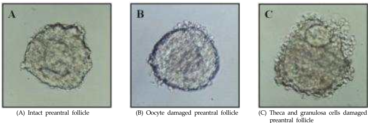
Fig. 1. Morphology of preantral follicle isolated from vitrified mouse ovary.

After 10 days of IVG, follicles were allowed to mature for 16~18 h in IVM medium supplemented with 1.5 IU/ml hCG (Profasi; Sereno) (Fig. 2). A part of matured follicles were selected randomly and adherent cumulus cells were removed. The maturation status and the diameter of the oocytes excluding the zona pelluci-