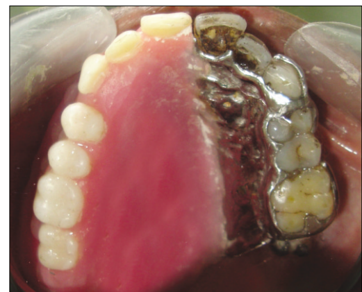
Fig. 6. Intraoral obturator prosthesis (mirror view).