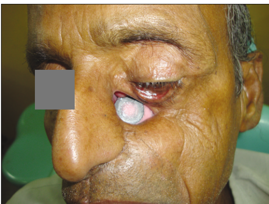
Fig. 5. Intraoral obturator prosthesis with magnet.