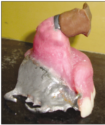
Fig. 7. Intraoral prosthesis attached to extra oral prosthesis.