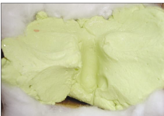
Fig. 2. Facial moulage impression made with irreversible hydrocolloid impression material.

A facial moulage impression was made with irreversible hydrocolloid (Algitex, DPI, Mumbai, India) to record the facial defect along with surrounding normal structures (Fig. 2). Opened gauze squares were placed on the alginate for mechanical retention