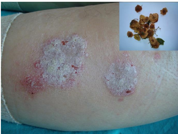
Fig.2. Psoriasis lesions and seeds of Paliurus spina-christii (the patient had drunk after).