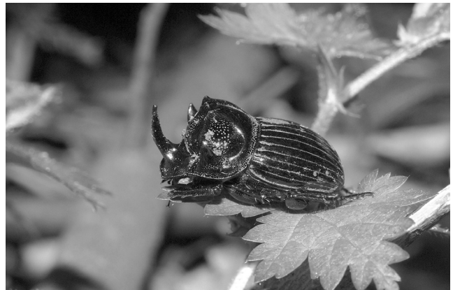
Figure 2. Copris tripartitus Waterhouse, the Second Grade of Endangered Species in Korea, collected from Mulyeongari-Oreum Wetland and Mt. Sooryeong in 2008

tripartitus Waterhouse was first reported by Cha(1999) and confirmed in this survey in 2008. This means that the habitat has been preserved well for nearly ten years and that conditions favor C. tripartitus Waterhouse habitation as cow and horse dung is very abundant. Although L. deyrollei (Vuillefroy) has not been reported in this survey, in 2008, as well as 1998 to 1999, it was reported in two places near Dongbaekdongsan(Mt.) which is near Mulyeongari-Oreum Wetland. Considering that, it is highly probable that they still inhabit this area. As they are a protected species being endangered, continuous and precise monitoring should be performed. In the nighttime light trap survey, Lychnuris rufa (Olivier) was identified. Thus, it seems that two kinds of fireflies inhabit this area with Luciola lateralis Motshulsky which was identified by hearing from local residents.