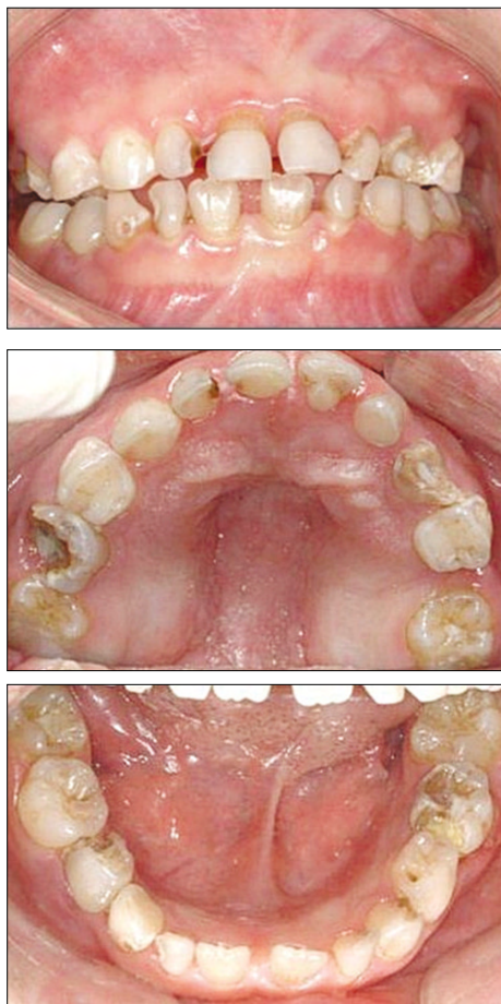
Fig. 1. Initial intraoral photo before treatment. (Age: 7 years and 1 month)

Dental treatment was carried out under general anesthesia mainly due to the lack of patient cooperation. Extraction of multiple teeth(upper right second primary molar, upper left primary canine, lower left second primary molar and lower right first primary molar) with severe caries was carried out. Pulpectomy of the upper right first primary molar, upper left first primary molar, lower left primary canine, lower left first primary molar and lower right second primary molar was performed and restored with stainless steel crown. Four band and loop space maintainers were delivered in order to preserve the open spaces(Fig. 2). 3-month follow-up visit was carried out for 7 years and the patient is now 14 years old. Peg lateralis, two congenital missing second premolars and slight gingival enlargement can be seen(Fig. 3). Oral hygiene and patient's cooperation has improved dramatically.