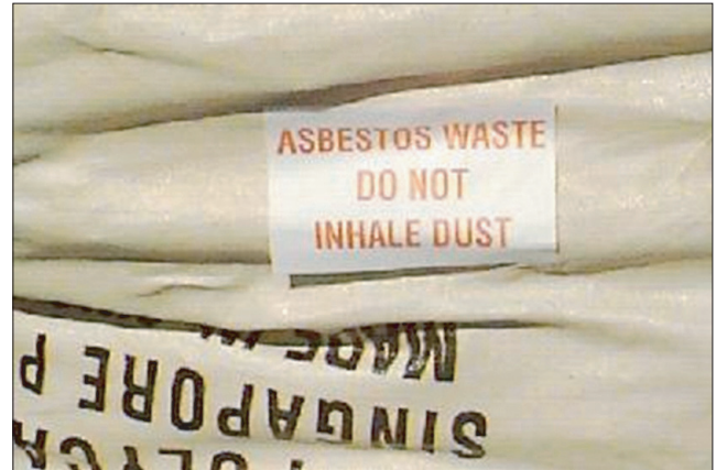
Fig. 4. Disposal bag containing asbestos waste with the affixed warning label.

For decontamination purposes, it is also important to set up proper washing and changing facilities for workers to wash themselves and to change into street clothing after the asbestos removal work (Fig. 3). Three areas including a “clean area”, a “shower area” and a “dirty area” have to be established in the worksite. During the asbestos removal work, workers should only be allowed to enter and exit the worksite through the established washing and changing facilities. Also, PPE should be put on before entering the asbestos work area. In addition, efficient local exhaust systems should be installed whenever mechanical cutting, sawing or machining of soft asbestos insulating boards or hard asbestos cement building boards takes