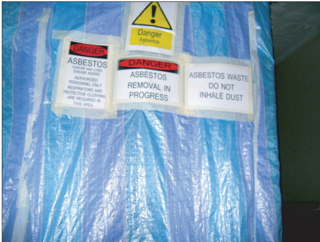
Fig. 2. A warning sign displayed at an asbestos work area.