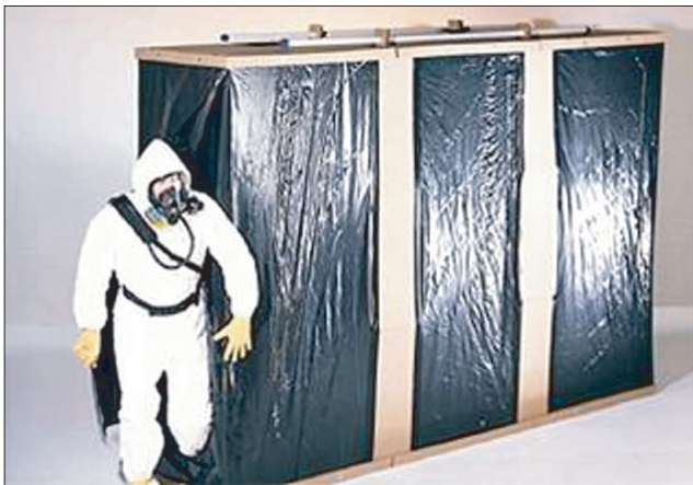
Fig. 3. Isolated changing room with shower facilities for worker to remove personal protective equipment.

down as they can circulate asbestos dust to other parts of buildings. Further, all exhaust air from the asbestos work area must pass through a high efficiency particulate air (HEPA) filter before release into the environment.