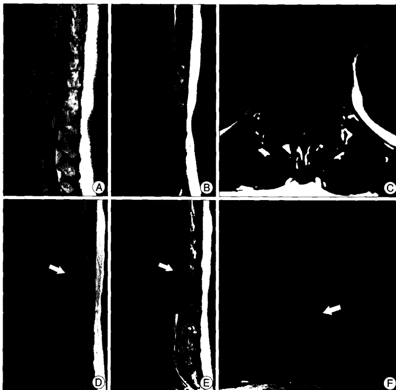
Fig. 1. The initial magnetic resonance (MR) image shows (A) a heterogeneous, slightly hyper-intense abnormal signal in the spinal canal on the sagittal T1-weighted image and (B) a low signal on the sagittal T2-weighted image. The axial T2-weighted images (C) demonstrate the subdural location of the hematoma in the dural sac. Follow up MR image (D, E, and F) shows a nodular mass (arrow) between the T12 and L1 level. The lesion is iso-intense to the spinal cord on the T1-weighted imaging and slightly hypointense to the spinal cord on the T2-weighted image but had no vascular flow voiding.

MR imaging best shows the extent of the hemorrhage and delineation from the epidural space. Differentiating between a subdural and subarachnoid hematoma is difficult, and in some cases, only surgical exploration will demonstrate the precise location of the hematoma. However, pure SSAH as in this case can be easily differentiated from the subdural hematoma. SSAHs are located within the thecal sac without an inverted "Mercedes star sign", which is a typical finding in subdural hematoma 4 . MR imaging also can demonstrate a