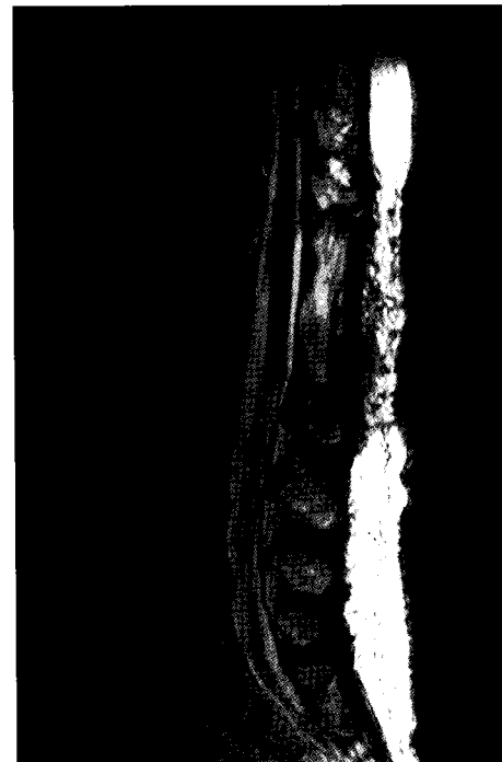
Fig. 4. Follow up MR images after 6 months showing resolution of hematoma and no vascular abnormality on the sagittal T2-weighted image.