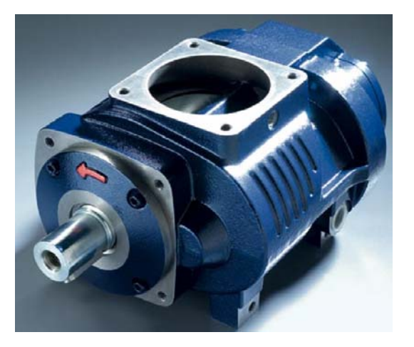
Fig. 4 Two-stage oil flooded screw compressor plant