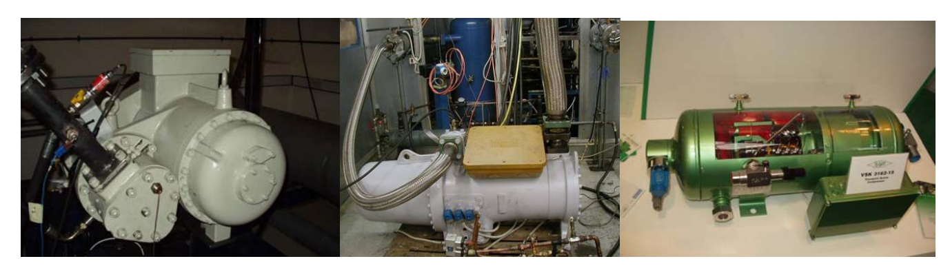
Fig. 6 Refrigeration compressor, Zhang et al, 2006

Early works in refrigeration compressors resulted in a design presented in Fig. 5, Zhang et al 2006, later Broglia et al 2006 published their work, Fig. 6 and modern practice is applied for efficiency improvements in the refrigeration compressors presented in Fig. 7.