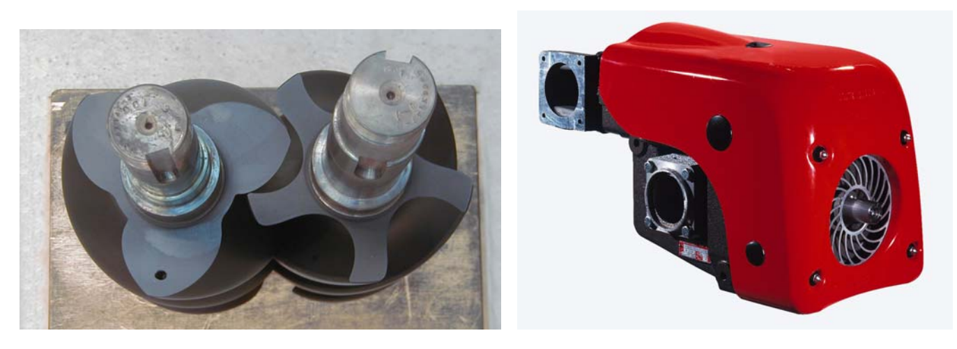
Fig. 3 Rotor profile for delivery of dry air, McCreath et al, 2001

McCreath et al, 2001 published a paper which describes two high efficiency oil-free screw compressors designed for dry air delivery. Their design is based on rack generated 3/5 rotor profiles, shown in Fig. 2.