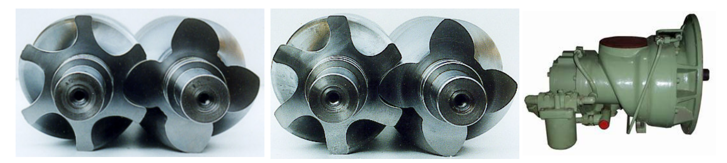
Fig. 2 Rotor retrofit in oil-flooded screw compressors, old rotors left, new rotors, right, Stosic et al, 2000

Since the market for oil-flooded screw air and refrigeration compressors is highly competitive, new designs are continually being introduced which are more efficient and cost effective than their predecessors. However, because of the high cost of development of new machines, manufacturers seek to maintain their existing designs for as long as possible. Closer study of many of the older designs has shown that in the majority of cases, all that is required to bring them up to date is to change the rotor profile to one of a more recent type. An example of this is given by Stosic et al , 2000 , which describes the retrofit of new rotors into an existing family of oil-flooded compressors instead of A rotors. The old and new rotors are compared in Fig. 3.