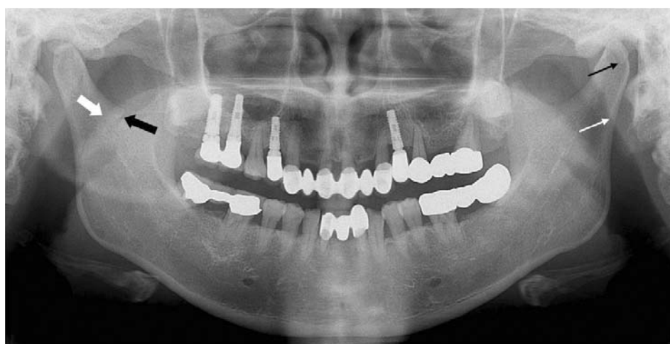
Fig. 2. Panoramic image shows soft palate (thick white arrow), subcondylar fracture (thick black arrow), spine of sphenoid bone (thin black arrow), and pharyngeal wall (thin white arrow).

t-test and the difference between the two groups in the second evaluation by student's t-test using SPSS 11.0 for Windows software (SPSS Inc, Chicago, IL). P-values less than 0.05 were considered statistically significant.