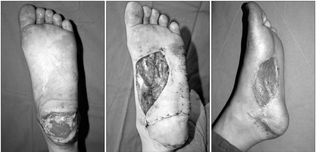
Fig. 3. Case 12. Medial planter flap. (Left) 8 \times 7 cm soft tissue defect caused by trauma. (Center) A medial planter flap was elevated and placed over the defect. (Right) POD 4 months.

graft. This type of coverage can have a good result because much of the weight-bearing normal soft tissue around the defect still remains (Fig. 2).