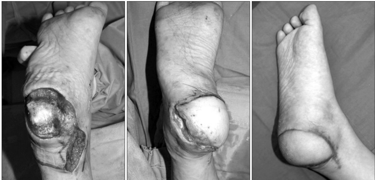
Fig. 4. Case 15. Anterolateral thigh fasciocutaneous free flap. (Left) 10 \times 6 cm soft tissue defect caused by a pressure sore. An incision was made in the medial malleolar area in order to approach the pedicle. (Center) An anterolateral thigh flap was placed over the defect (Right) POD 4 months.