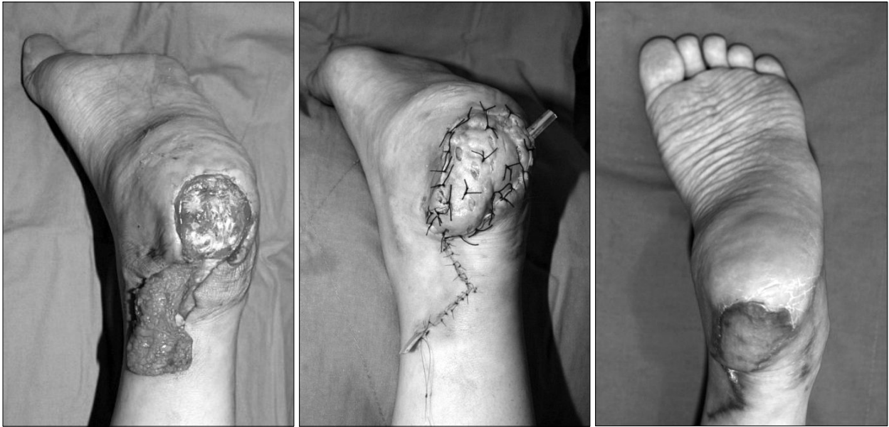
Fig. 2. Case 3. Adipofascial flap. (Left) 5 \times 5 cm soft tissue defect caused by a pressure sore. An incision was made in the medial malleolar area for elevation of the adipofascial tissue. (Center) An adipofascial flap was insetted and a split thickness skin graft was performed. (Right) POD 4 months.