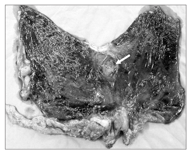
Fig. 3. Finding of the resected stomach. Near total gastric mucosal necrosis and longitudinal dehiscence at lesser curvature side were identified (Arrow = longitudinal dehiscence of the gastric wall at the lesser curvature side).

struction and performed emergency laparotomy. Operative findings revealed that the stomach was massively distended and that a large sludge of the soaked laver was impacted at the antrum when gastrotomy was performed. After the removal of gastric contents, we examined the gastric mucosa. The entire gastric mucosa exhibited generalized edematous changes and easily came off with palpation (Fig. 2). We observed several enlarged lymph nodes around the perigastric area and mild hardness of the antrum; however, there were no obvious findings suggesting gastric cancer despite the severe gastric dilation. We suspected gastric cancer associated with gastric outlet obstruction. However, we did not perform a definitive cancer surgery because of the patient's condition. The patient un-