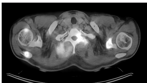
Fig. 2. PET-CT shows increased uptake in the vertebra, paravertebral muscle.

metastasis was examined (Table 1), and the difference of the mortality rate according to with or without treatments for bone metastasis was analyzed, as well as the treatment methods SPSS 13.0 (statistical Package for Social Science version 13.0, SPSS Inc., Chicago, IL, USA) was used for the data analysis, the survival rate was obtained by the Kaplan-Meier method and the significance of the