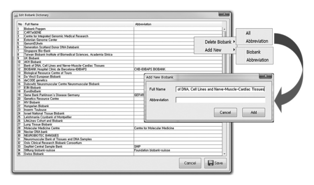
Fig. 2. Editing the ManBIF biobank dictionary.

*Corresponding author: E-mail kjpark63@gmail.com Tel +82-43-719-8850, Fax +82-43-719-8869 Accepted 7 March 2011