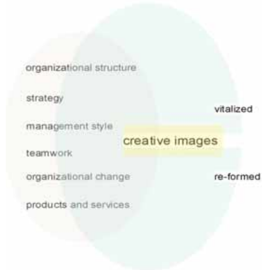
Fig. 1. Illustration of the new paradigm of systems thinking

Therefore, organizational structure, strategy, management style, teamwork, organizational change, and even products and services can be vitalized and re-formed through creative images that allow us to act in new ways [15].