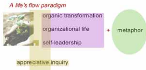
Fig. 4. Illustration of an interior design life's flow paradigm

Moreover, the concept of appreciative inquiry, distinctions between organic and mechanical organizations, the use of images and metaphor helped to increase understanding of organization. Finally, we need to recognize that despite its roots in mechanistic thinking, organization is a creative process of imagination. We organize as we imagine, and it is always possible to imagine in new ways. In appreciating this, we open the way to numerous possibilities and to a key competence for managing in turbulent times [15].