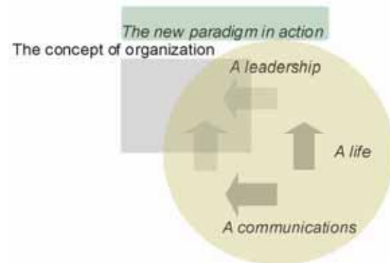
Fig. 2. Illustration of the new paradigm in action