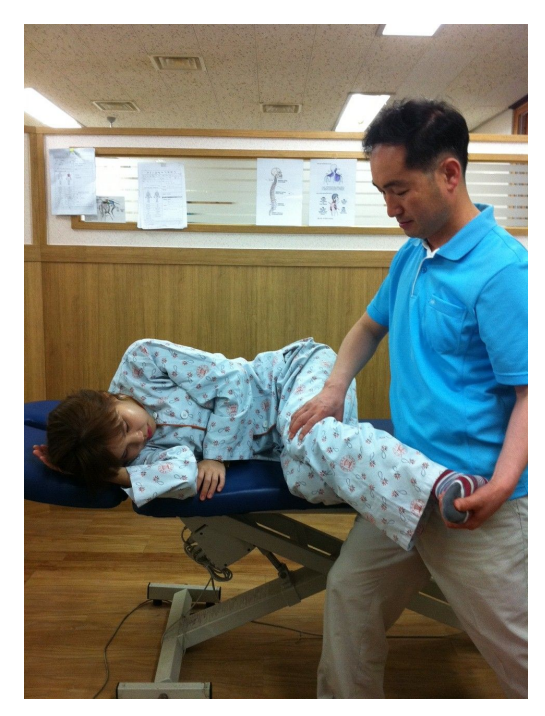
Fig 3. Modified bowstring test

Modified bowstring test(MBT) utilised that can be placed on the bowstring by patient sidelying. The patient lies in a sidelying, facing the edge of the table. It is important that to avoid side flexion of lumbar spine a small pillow is placed under the patient's lumbar. For the starting position to the test, the hips are flexed to approximately 70° with the knee flexed to a degree that is stable and comfortable for the patient body. The physical therapist stands in front of the patient at the level of her knee and one hand is placed of the dorsi flexed of foot the other thumb is placed of middle of the posterior knee joint between the femoral condyle. The patient's arms are folded across the chest with hands of opposite shoulders. The clinician moves the patient's shoulder caudally to produce flexion in the spine keeping the lumbar is maintained in neutral position. The physical therapist puts on stretch the knee with dorsiflexion of the ankle joint, once the point of irritation has been reached, the patient's knee is gently flexed untill the symptoms fade, the clinician presses into the popliteal fossa in the middle knee and the patient is asked to raise