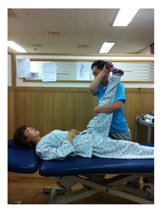
Fig 2. The SLR test

tingling), there is asymmetry when testing right and left sides(limitation in range of motion, resistance of movement, production of symptom during movement), test responses altered by movement of distant body part(neck, ankle). The test is performed by more than 10 years an experienced physical therapists who did not have knowledge of the MRI results on each side and sound side is priorly(Kostopoulos, 2004).