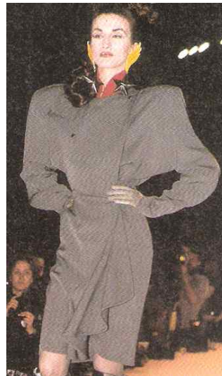
Figure 11. Thierry Mugler 1986 F/W from Geum et al. (2006), p. 270