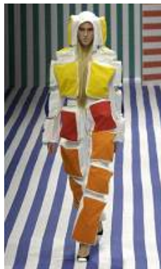
Figure 25. Jean Charles De Castelbajac 2008 s/s