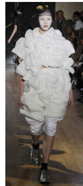
Figure 19. Maison Martin Margiela 2010 fall