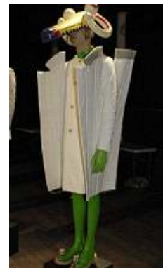
Figure 27. Walter Ban Beirendonck 2008 s/s