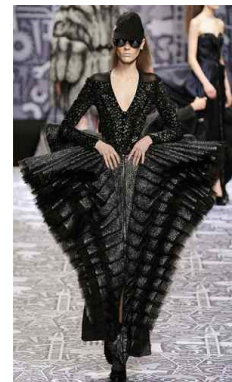
Figure 31. Victor & Rolf 2010 fall