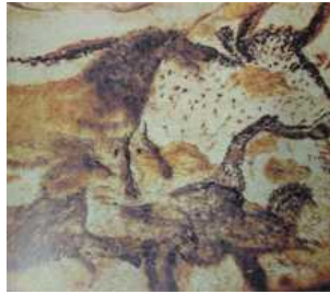
Figure 2. Lascaux Cave Paintings from Lim (1990), p. 121