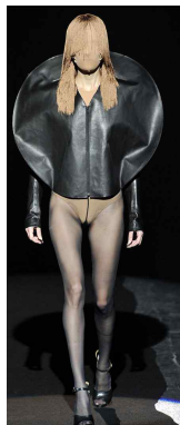
Figure 29. Maison Martin Margiela 2009 spring