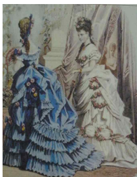
Figure 8. Bustle-decorated dress from Bae (2008), p. 272

The bustle style of the 19th century utilized bustle (or toumure) pads to emphasize protruding hips. This style used two braces: hip drape and hip bag. The braces were decorated by extravagant ruffles and laces to render the distorted shape of overly protruding hips. To emphasize slender waists and to maximize skirt widths, this style overly distorted waists (Figure 8 and Figure 9).