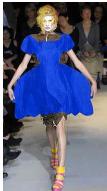
Figure 13. Comme des Garçons spring 2008