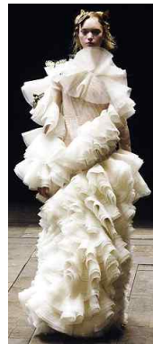
Figure 18. Comme des Garçons fall 2006 from www.style.com