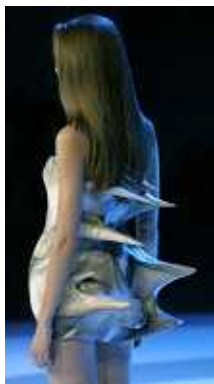
Figure 20. Hussein Chalayan 2009 s/s

Partial distortion is adopted to dresses that can maximize the distortion effects. Dresses looking ordinary on the face have deformed and unrealistic backs draping like melting ice cream (Figure 20), or exaggerated shoulders looking bizarre and strange (Figure 21). Figure 21 expresses unexpected reversals by overly emphasizing shoulders, departing from typical feminine designs. Figure 22 also emphasize shoulders by attaching distinctive decorations. These designs create optical illusions as if the parts of human bodies move around, which is only possible in imagination. Margiela's tops and bottoms are bizarrely matched (Figure 23). It is a fresh reversal to wear an ordinary turtle-neck sweater with a grotesque cylindrical skirt. This image goes against usual expectations by shocking tools, creating an optical illusion in that two different-sized people are combined. Partial distortion by partial emphasis, despite the smaller scale than the entire distortion, delivers more dramatic messages.