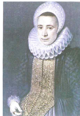
Figure 7. Round ruff collar from Jung (2006), p. 174