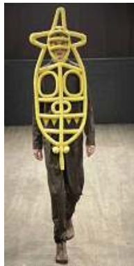
Figure 17. Walter Ban Beirendonck 2008 f/w from Kim (2009), p. 56