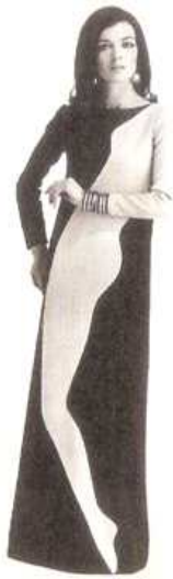
Figure 10. Yves Saint Laurent 1966/67 F/W from Buxbaum (2009), p. 179