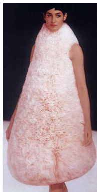
Figure 24. Hussein Chalayan 2000 s/s Extreme Beauty

ors to each part gives a building-like look, rather than a dress (Figure 25). Liberal designs are created by attaching rectangular patches on the shoulders, or introducing large rectangles to body sides (Figures 26 and 27). Distorting the upper body into a UFO shape, and expressing a waist and legs by a large triangle with a futuristic material (Figures 28, 29, 30, and 31) create fresh looks. Utilizing 3D designs and components in dresses can display unlimited imaginations and potentials.