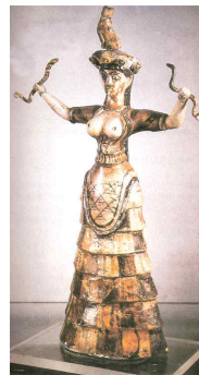
Figure 5. Goddess statue of Crete from Janson (1991), p. 142