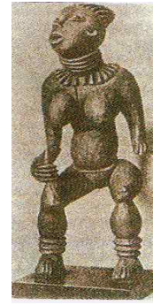
Figure 3. Sculptures of the Venda Tribe from Arnheim(1999), p. 88