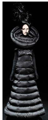
Figure 30. Junya Watanabe 2009 fall