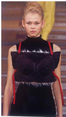
Figure 12. Issey Miyake f/w 2000 Extreme Beauty, Koda (2001), p. 56