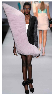
Figure 22. Victor& Rolf 2010 spring