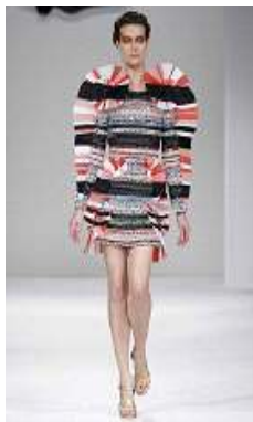
Figure 28. Victor & Rolf 2009 s/s