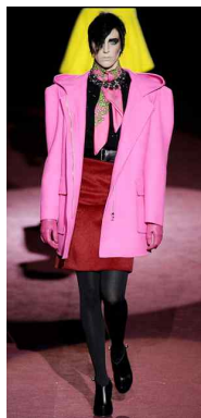
Figure 21. Marc Jacobs 2009 fall