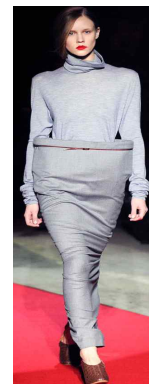
Figure 23. Maison Martin Margiela fall 2010