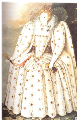
Figure 6. Cylindrical-brace skirt from Kim (2009), p. 145

The Middle Ages lasted for about 1,000 years from the late 5th century (A.D 476) when the Western Roman Empire collapsed to the Renaissance of the 15th century. Early Medieval dresses were not much different from the ancient style. However, Renaissance designs show emphasis, exaggeration and even distortion of body images in order to fully express the beauty of human body, in accordance with the philosophy of the period. Men's dresses emphasize shoulders and chests to maximize manliness. Codepieces were used not only as a protection gear, but also as an accessory. Women wore cor-piques, stomachers and farthinggales to maximize the beauty of their bodies. Skirt braces were particularly distorted, from cylindrical shapes to several layers of cylinders. Ruff collars with distorted neck shapes were also very popular. The invention of iron steel made it possible to create large wrinkles on ruff collars. The ruffles grew larger eventually to fully cover shoulders (Figures 6 and Figure7).