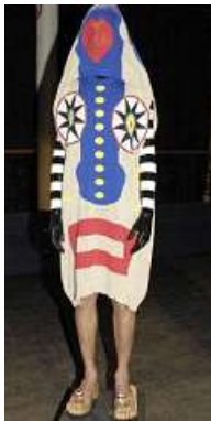
Figure 16. Walter Ban Beirendonck 2008 s/s from Kim (2009), p. 80