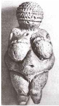
Figure 1. The Venus of Willendorf from Janson (1991), p. 78