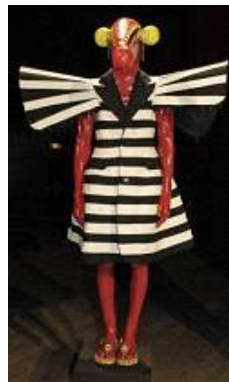
Figure 26. Walter Ban Beirendonck 2008 s/s