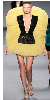
Figure 15. Victor& Rolf 2010 spring www.style.com