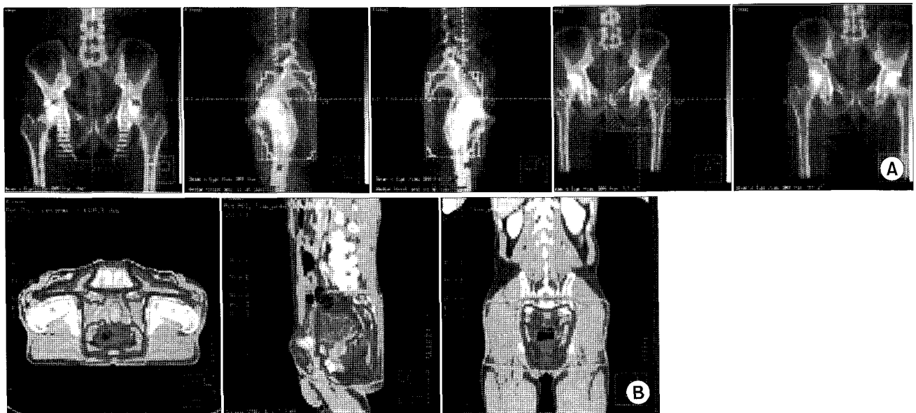
Fig. 2. Beam's eye views (A) and isodose curve (B) of 3-field technique with electron inguinal boost (technique 2).

delivered to all 17 patients. 5FU and mitomycin regimen was given to 70% (12 patients), 5FU and cisplatin was to 24% (4 patients) and 5FU monotherapy was to 1 patient. Twenty-percent reduced dose was delivered to 3 patients over age 70. Two cycles of adjuvant chemotherapy was given to 1 patient with external iliac lymph node metastasis. There was no significant difference in chemotherapy between 2 groups (Table 2).