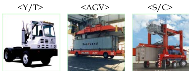
Fig. 1 Transportation equipments in container terminals

Until now, major in-yard transportation equipments at container terminals are Yard Tractor-Trailer (Y/T), Straddle Carrier (S/C) and Automated Guided Vehicle (AGV 1) ) <Figure1>.