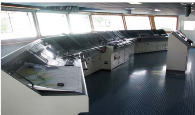
Fig. 1 Bridge of training ship

Although the required equipment varies according to the ship's type or size, generally between 40 to 80 control or display devices are necessary for ship navigation. The subject was the university training ship, and the survey asked its operators about the importance of, usage frequency of, influence on voyage of, possibility of error from, and error experience gained related to the operation of a total of 75 pieces of equipment from the model ship, including navigational equipment and control and display devices. After evaluating their usability and optimization, this study suggests an optimal ergonomic layout of on-Bridge navigational equipment.