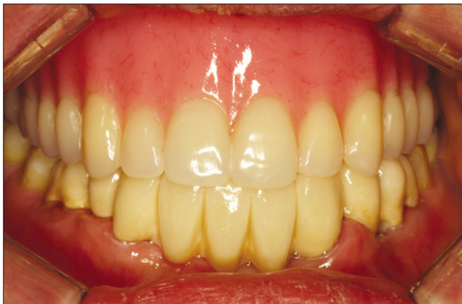
Fig. 6. Final prostheses.