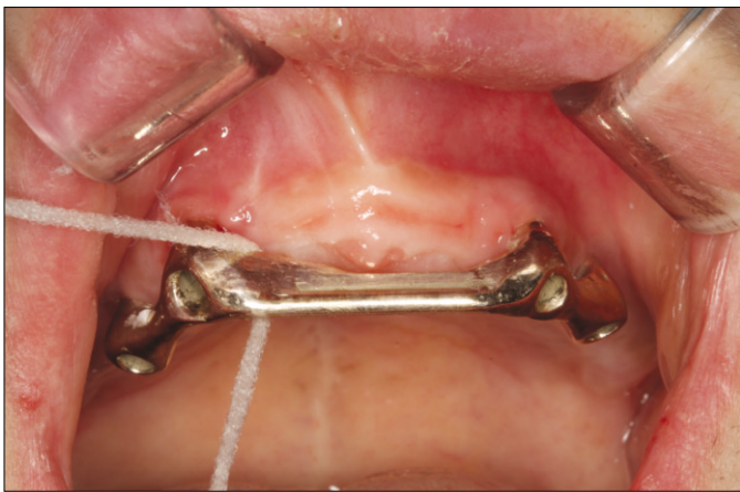
Fig. 8. Maintenance care instruction.

maintenance program was instituted with periodontal recall every 3 months following delivery of the definitive restorations.