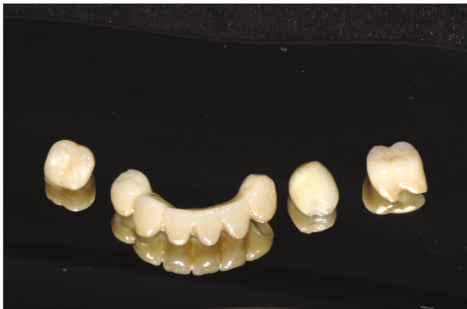
Fig. 4. All-ceramic restorations.

Wax denture try-in for the maxilla and zirconia framework try-in for the mandible were done. The all-ceramic restoration between the left mandibular canine and right mandibular first premolar was designed to a six unit restoration, because the lack of MD space was expected. The other all-ceramic restorations in the mandible were fabricated separately. Lower all-ceramic restorations using Lava system™ (3M ESPE, St. Paul, MN, USA) were completed (Fig. 4). Final cementation was carried out using resin cement (Multilink, Ivoclar Vivadent Inc., Lichtenstein, Germany). A Hader bar® (Attachments International Inc., San Mateo, CA, USA) for the maxillary implant-supported overdenture was fabricated (Fig. 5). Marginal fits of the Hader bar were evaluated with one-screw test, screw resistance test, Fit Checker II (GC Corporation, Tokyo, Japan) and periapical radiograph. After delivery of the final prostheses, soft tissue profiles were evaluated in the frontal and lateral view (Fig. 6, 7). A daily maintenance care by patient's effort was instructed using interdental cleaning aids (Fig. 8). A regular