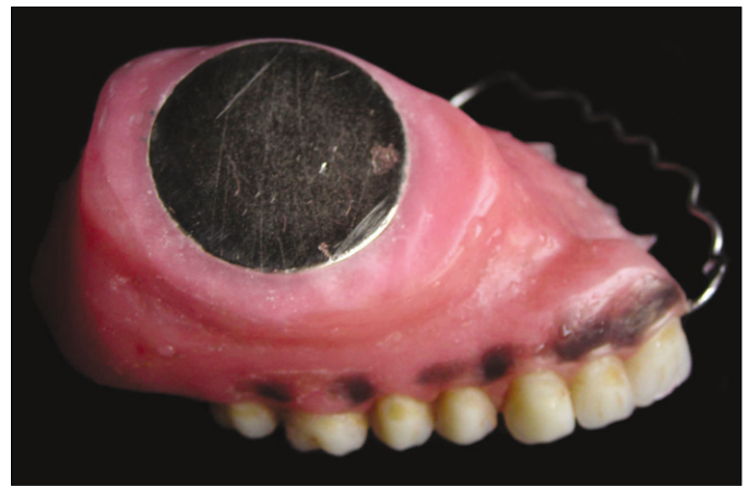
Fig. 3. Magnet embedded into superior-lateral aspect of obturator prosthesis.

nique. 9 After finishing and polishing the obturator, the gingival portion of the prosthesis was color modified with the auto-polymerizing clear PMMA (Cold cure-clear, Dental Products of India, Mumbai, India) mixed with acrylic-colors to match the normal melanin-pigmented gingiva of the contralateral side. The prosthesis was delivered to the patient and final occlusal refinement was completed (Fig. 2). The patient experienced improvement in speech intelligibility and deglutition after the placement of the maxillary obturator. A pair of Cobalt-Samarium magnets 30 mm in diameter and 2.5 mm in thickness (Jobmasters, Randallstown, MD, USA) was selected for mutual retention between intraoral and extraoral prostheses. One of the magnets was embedded in the superior-lateral aspect (portion which was exposed extraorally) of the obturator by using auto-polymerizing PMMA thus completing the intraoral section of the IECP (Fig. 3).