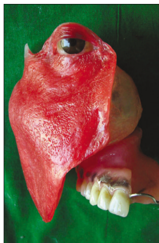
Fig. 7. Final wax festooning and contouring. Note the relationship of extraoral trial prosthesis with intra-oral obturator prosthesis when stabilized against each other with the help of intermediate pair of magnets.