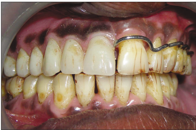
Fig. 2. Intraoral view of completed obturator prosthesis. Note gingival portion of prosthesis was color modified to match opposite side melanin-pigmented gingiva.