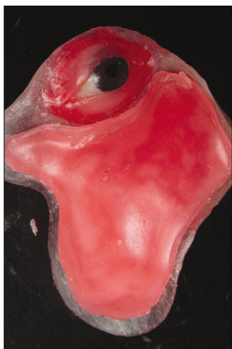
Fig. 5. Wax sheet contoured to allow 3 mm of uniform thickness of silicone for future normal facial contour.