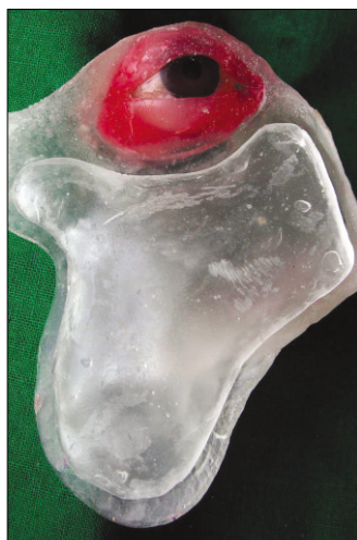
Fig. 6. Separately processed top layer framework attached with underlying framework using auto-polymerizing PMMA.