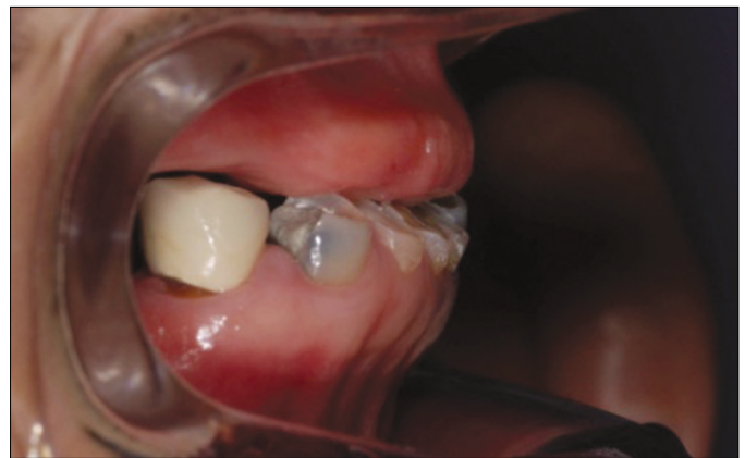
Fig. 2. Initial intraoral photograph.