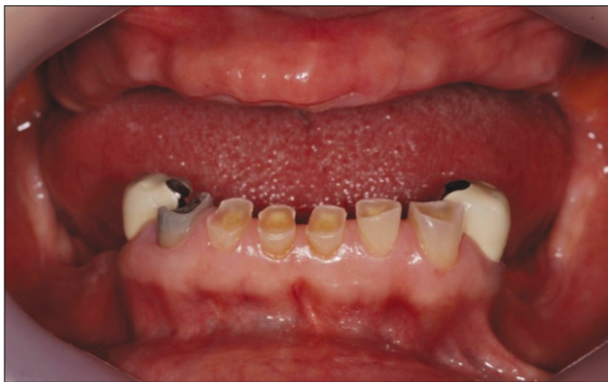
Fig. 1. Initial intraoral photograph.

and 1998 and was under warfarin medication. Following problem lists were detected. The mandibular anterior teeth showed extremely short clinical crown length. The reverse compensating curve of the old prostheses, overgrowth of mandibular symphysis area, and bone resorption of mandibular posterior region were observed. The possibility of combination syndrome was anticipated due to the recent extraction of maxillary anterior teeth (Fig. 1 and 2). As Davarpanah et al. 1 suggested, a thorough examination was performed. In radiographic examination, any periapical radiolucency was not detected even though the dentin was exposed to oral cavity. The periodontal ligament was within normal limit. The crown-to-root ratio was about 1:3. In clinical examination, attached gingival band was 4 to 5 mm width, and periodontal pocket depth was 3 mm or less. Neither periodontal problem nor tooth mobility was detected. On the properly mounted diagnostic cast examination, the imaginary line from retromolar pad 2/3 point to mandibular premolar tip was drawn. The distance between the imaginary line and the mandibular incisor's tip was 4 to 5 mm. The clinical crown was 2 mm height. According to Ash and Nelson 7 , the diagnostic wax up was undertaken to allow the crown to be 9 mm length. Supposing the height of coping,