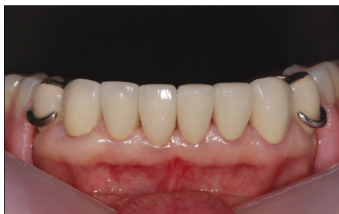
Fig. 8. Recall check - 4 months later.