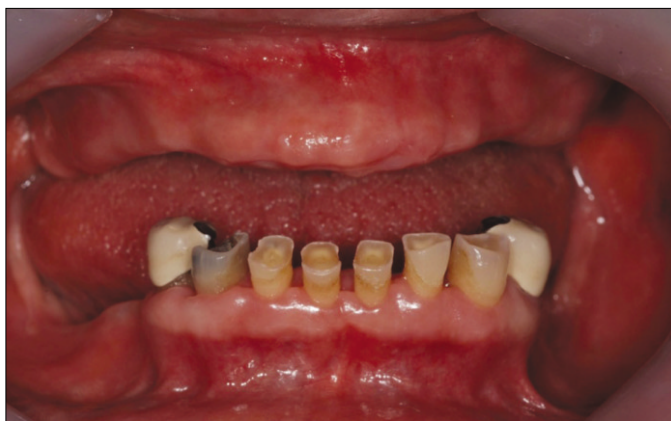
Fig. 5. After surgical crown lengthening procedure.

The patient was referred to the department of periodontology for surgical crown lengthening procedure, and visited our department 2 months after operation. The planned amount of crown length was gained enough (Fig. 5). The walls of the anterior teeth were prepared as parallel as possible. The individual trays were fabricated. One sheet of baseplate wax (Dae-dong industry, Daegu, Korea) was covered for relief and tray resin (Quicky, Nissin Dental Products Inc., Kyoto, Japan) was adapted to the cast. By using the individual trays, functional impressions were registered both in maxilla and in mandible. Maxillary wax rim was fabricated as a general method. The vertical dimension of the patient and the amount of anterior exposure were maintained equal to previous old denture. Mandibular recording base and wax rim were fabricated, and then the resin cap made of DuraLay resin (Reliance Dental Mfg. Co., Worth, IL, USA) was attached to the recording base for stabilization during interocclusal registration, as described by Chang et al. 9 (Fig. 6). Facebow transfer was followed by mandibular teeth wax up, coping fabrication and porcelain-fused-to-gold crown fabrication. After the