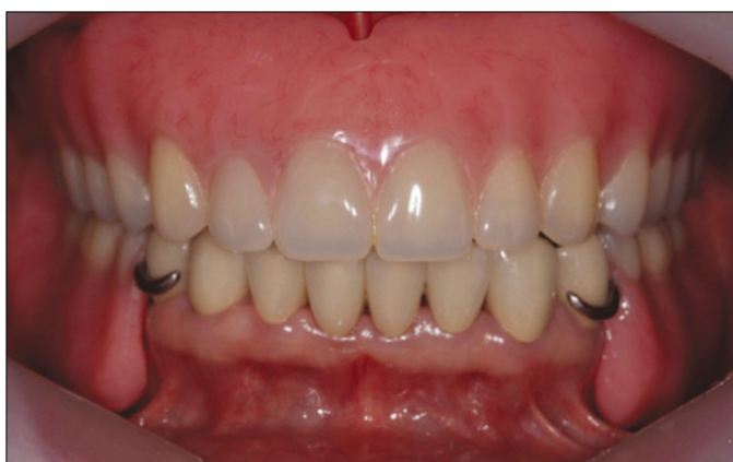
Fig. 7. Definitive prosthesis.