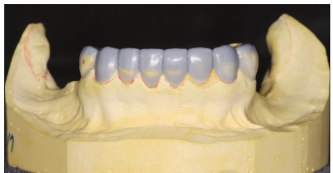
Fig. 4. Diagnostic wax-up.