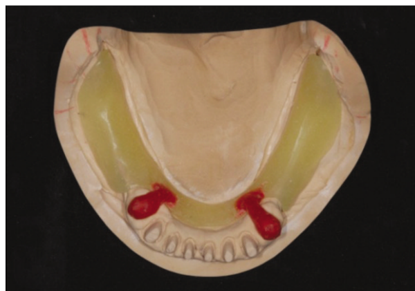
Fig. 6. Recording base and resin jig.