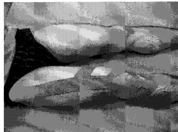
Fig. 1. Applying method of kinesio taping for rectus femoris and tibial external rotation.

Figure 1 shows the application of KT on the knee. The subjects sat on the table with the hip and knee flexed at 90°. The subjects were then taped with a Y-shaped Kinesio tape at the thigh according to the Kenzo Kase's KT manual [23]. The tape was applied from a point 10 cm below to the anterior superior iliac spine, bisected at the junction between the quadriceps femoris tendon and the patellar, and circled around the patellar, ending at tibial tuberosity. The first 5 cm of the tape was not stretched and acted as an anchor. The portion between the anchor and superior patellar was stretched to 120 %. The remaining tape around the patellar remained unstretched [19].