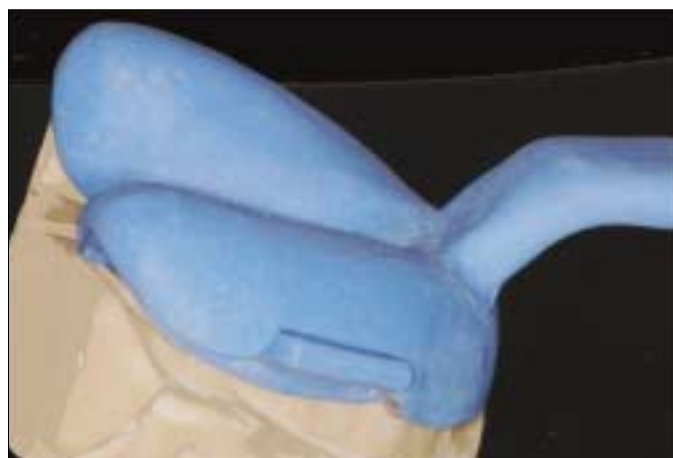
Fig. 4. Lateral view of overall trays. Note an indentation around the wing.