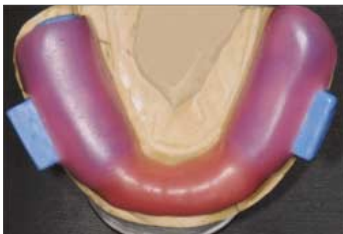
Fig. 3. Wax spacer for impression material was covered over the segmental trays and remaining teeth.