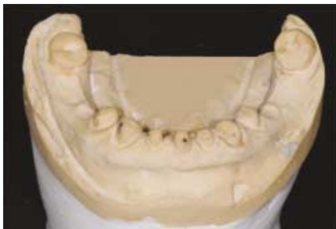
Fig. 1. View of a model requiring impression of multiple prepared teeth.