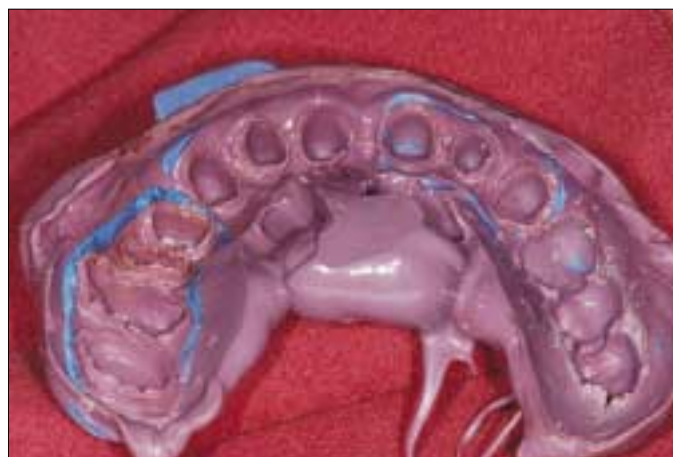
Fig. 6. View of an overall impression of another patient.