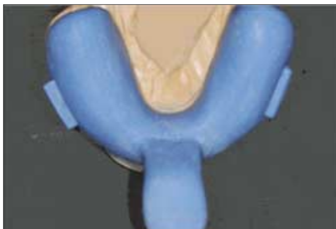
Fig. 5. Occlusal view of completed segmental trays and an overlay tray.