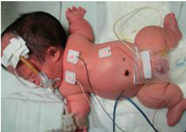
Fig. 1. Full-body photograph acquired on the 2 nd day of life, showing large head, markedly short limbs, and narrow thorax.

mother and did not undergo any antenatal evaluation. She visited our hospital when her labor pains started. The prenatal two-dimensional ultrasound examination just before the delivery showed polyhydramnios and short-limbed dwarfism. She had no history of drug, alcohol, or tobacco abuse. The baby's parents were healthy, and there was no family history of congenital abnormalities. At birth, the baby's heart rate and body temperature were 52 beats/min and 36.7°C, respectively. His Apgar score was 1 and 1 at 1 and 5 minutes, respectively. General appearance was cyanotic blue colored. The findings of arterial blood gas analysis showed: pH 7.08, PaO 2 44.7 mmHg, PaCO 2 61.1 mmHg, HCO 3 13.9 mmol/L and oxygen saturation was 75%, in spite of the oxygen therapy by face mask.