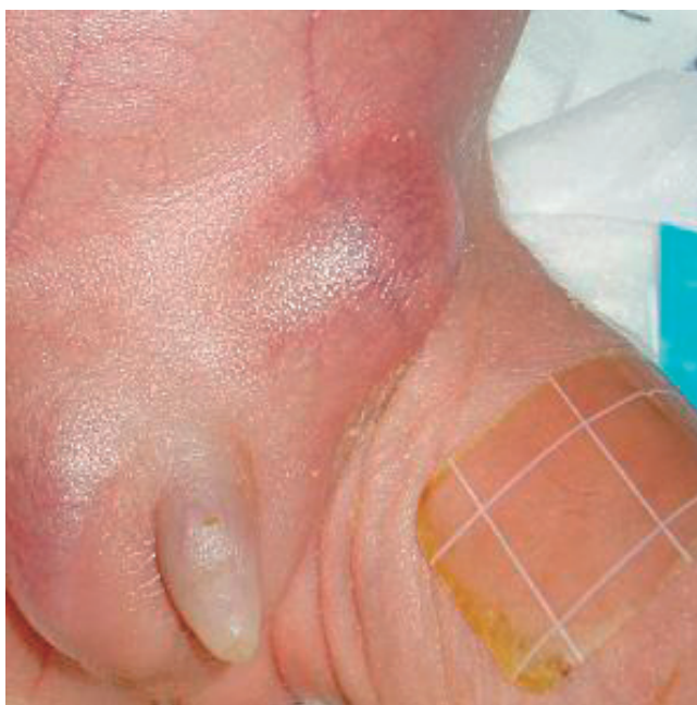
Fig. 1. A firm and enlarged 2×2 cm mass was observed in the left inguinal region.