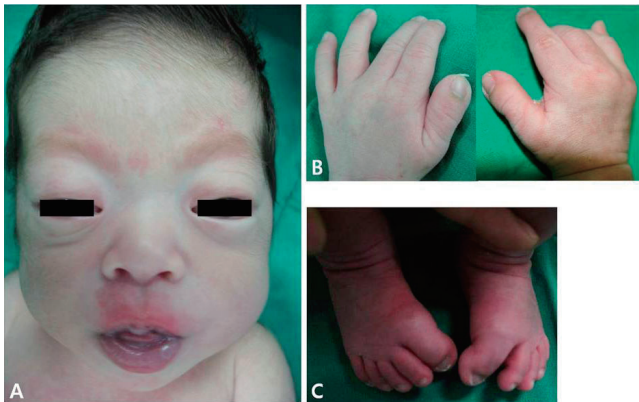
Fig. 1. Photographs of the patient. (A) Brachycephaly, hypoplastic mid-face, proptosis, and exophthalmos are shown in the photograph of the head. (B, C) The thumbs and the great toes are wide and bend away from the other digits.

abnormalities. A lateral spine view noted the disappearance of normal curvature of spine; spinal magnetic resonance imaging showed an outwardly everted coccyx (Fig. 2C), and plain radiographs of his hands and feet showed widening of both 1st phalangeal bones, metacarpal bones, and metatarsal bones. With informed consent, genomic DNA was isolated from peripheral blood. PCR was performed for exon 7 and exon 8 to analyze