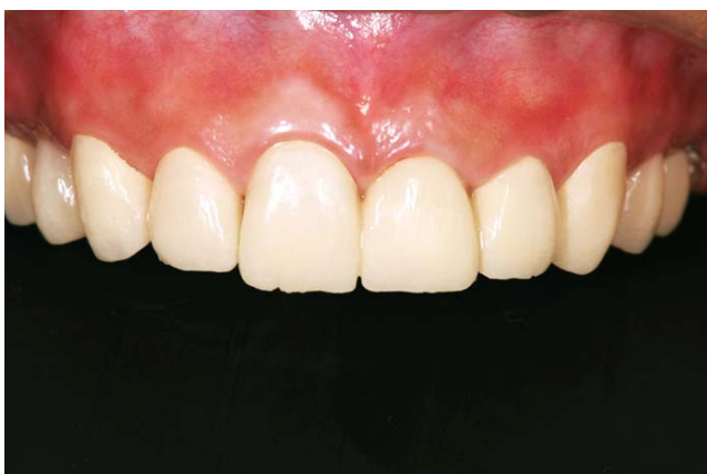
Fig. 9. Second provisional restorations. Because the cervical positions of the right and left central incisors were asymmetric, a gingivectomy is conducted.