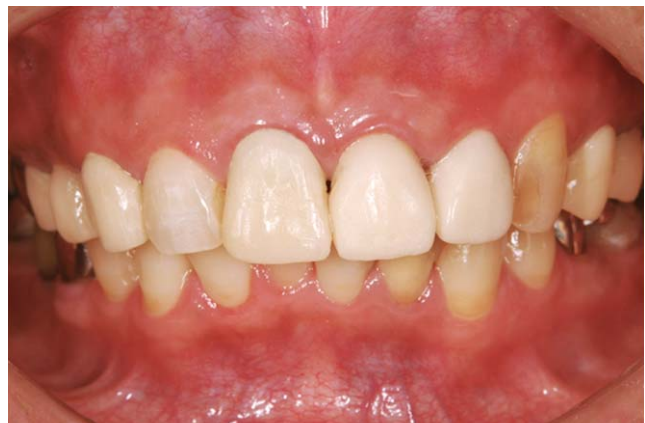
Fig. 6. 2 weeks after the removal of pigmentation.