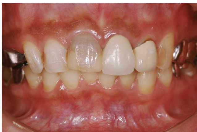
Fig. 1. Frontal view of the 39-year-old patient. Her chief complaint is discoloration of maxillary anterior teeth.