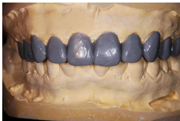
Fig. 2. A diagnostic wax-up is made. The shapes of teeth and gingival tissues were confirmed with the diagnostic wax-up.