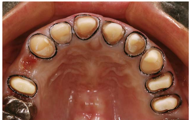
Fig. 8. Occlusal view of abutment teeth. In case of the non-vital tooth, a fiber post and composite resin core were used.