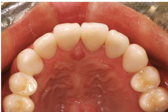
Fig. 11. Occlusal view after treatment.