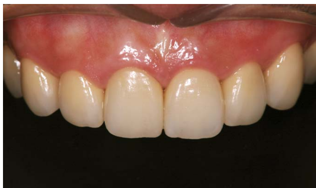
Fig. 14. Frontal view of the patient after treatment. The patient was quite satisfied with her new smile line.