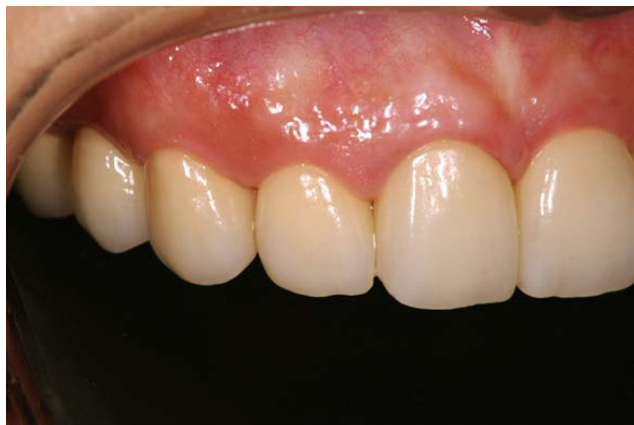
Fig. 12. Right lateral view after treatment.