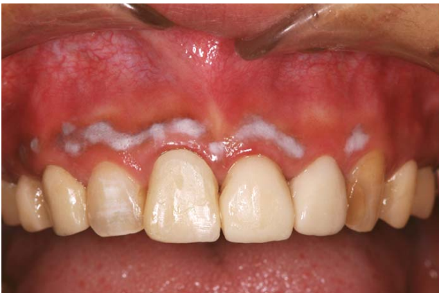
Fig. 5. Removal of pigmentation by using phenol and ethanol.