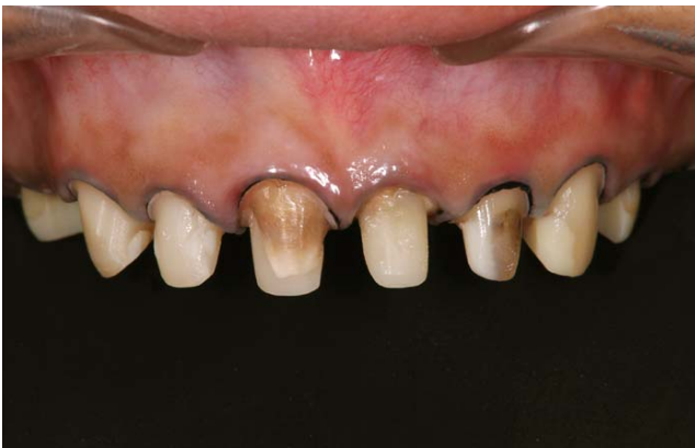
Fig. 7. Abutment teeth after preparation. Some discolored abutment teeth were observed.