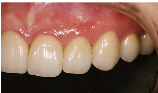
Fig. 13. Left lateral view after treatment.