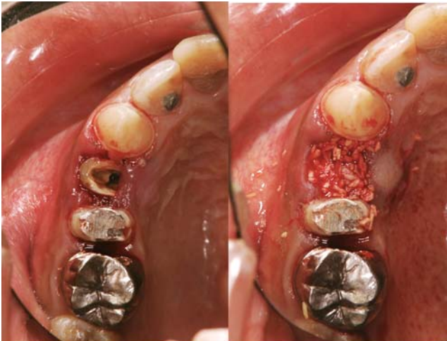
Fig. 3. After the extraction of the first premolar, a ridge preservation procedure was performed by putting FDDB in the post-extraction socket.