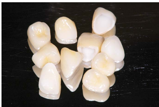
Fig. 10. Definitive crowns and a fixed partial denture fabricated by zirconia framework (Lava, 3M).