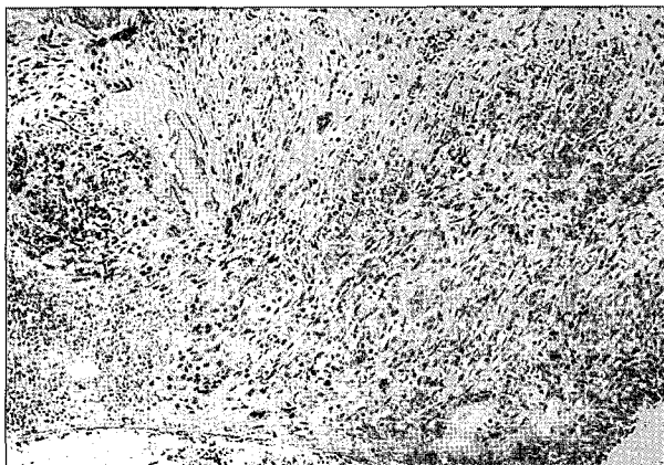
Fig. 4. Photomicrograph showing blood filling cavernous space surrounded by multinucleated osteoclastic giant cells, proliferating fibroblasts and capillaries (H&E stain, original magnification \times 200 ).