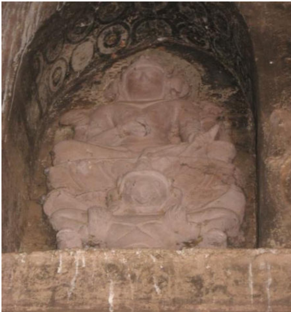
Figure 1. Vishnu at Nathlaung Kyaung, Bagan.