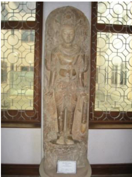
Figure 2. Brick image of the standing four-armed Vishnu at Nathlaung Kyaung, Bagan

With the emergence of primitive economy to feudal economy, the life styles and social patterns changes changed to feudal lords and serf society. Since then, there were sea ports, wharfs and harbors were established in Myanmar riverside. The trade with India became more extensively done and especially with the southern India. Since the emergence of socio-economic changes took place, the penetration of religious faith also existed. The early ideology and belief was Brahmana followed by Mahayana, Hterawada, which were emerged and accepted (Hla Pe 1962, 39). The influence and dissemination of Hindu and Buddhist polities reached to the Southeast Asian countries including Myanmar which made the emergence of building the city states in the early historic periods. And Tambiah noted the religion of Southeast Asia in his work as follow.