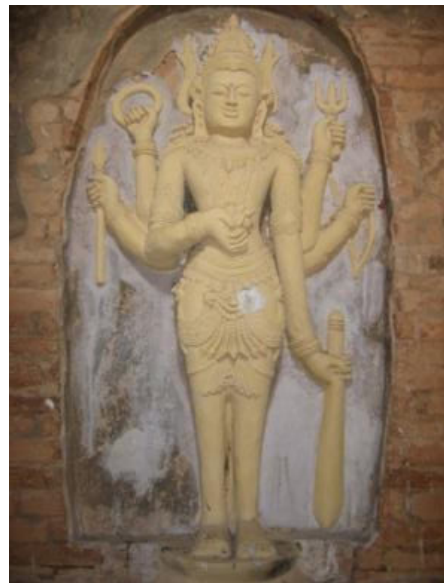
Figure 3. Shiva being displayed at Bagan Archeological Muuseum