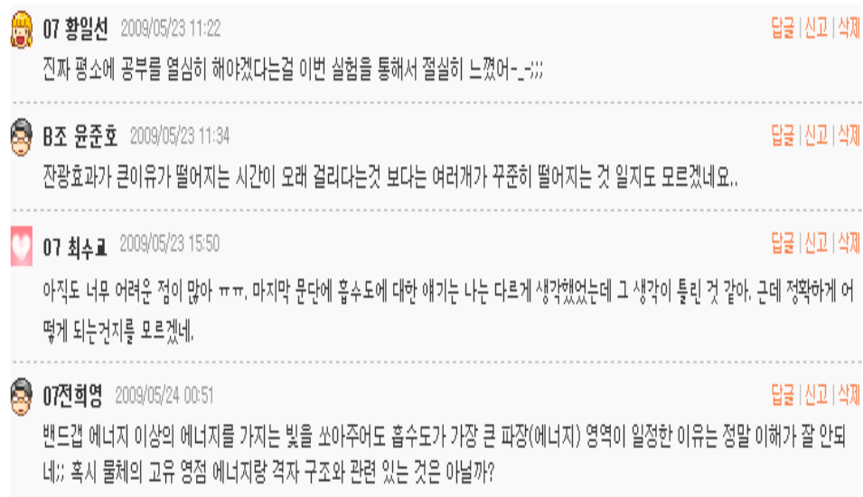
[Figure 3] Reflection comment